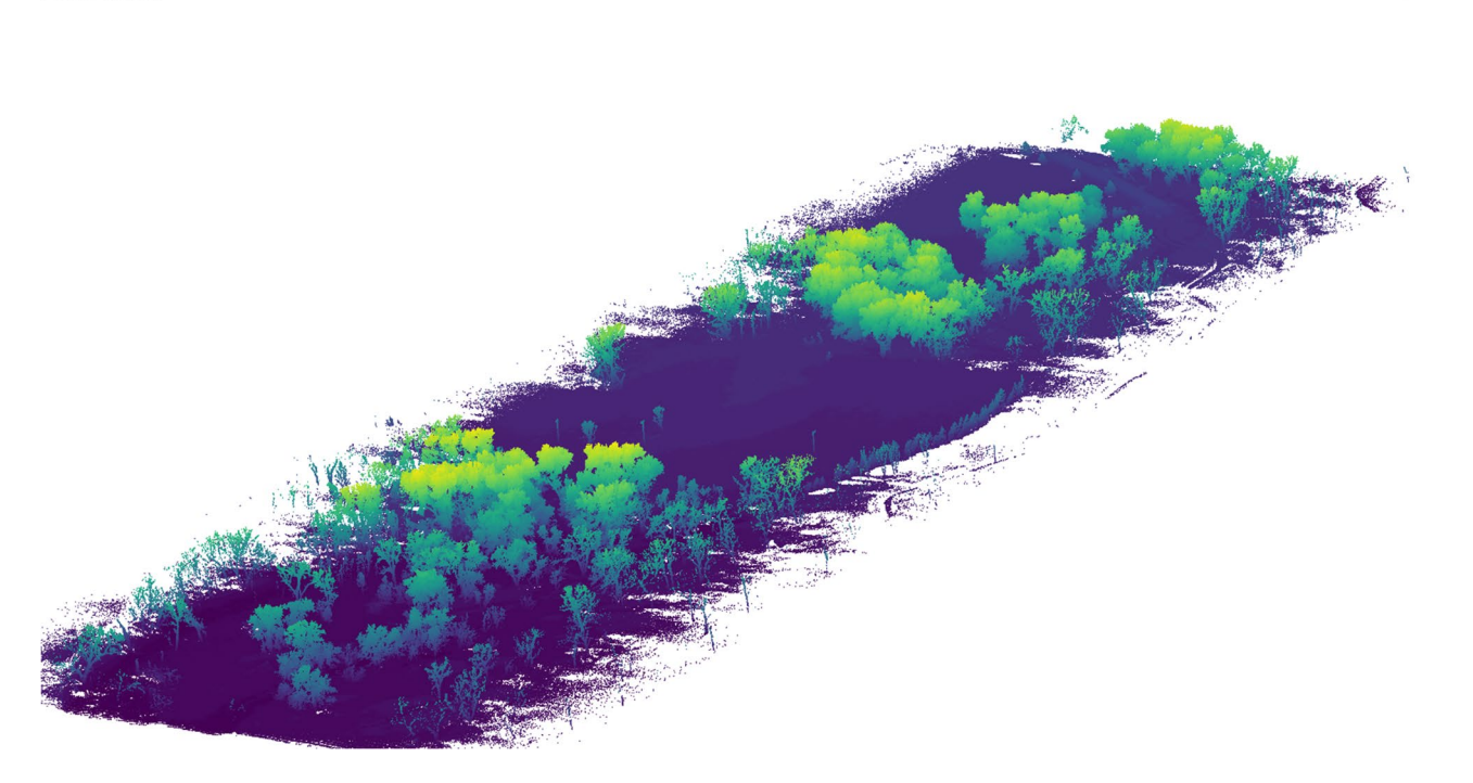
Fig. 3 Light Detection and Ranging (LiDAR) data play a significant role in estimating structural diversity in different ecosystems. The image shows the point cloud derived from an Unmanned Vehicle (UV) LiDAR flight (UV: DJI Matrice 600 Pro, LiDAR sensor: Yellowscan Surveyor) that highlights the structural complexity of a for-

Clusters of pixels identified in a multispectral or hyperspectral space identify the most probable groups of spectrally similar pixels (spectral species), which can be used as a basis for spectra inventories and for further calculating diversity metrics, including alpha-diversity metrics (e.g., Shannon's H, Simpson's D, Rényi's H_{\alpha} ) and dissimilarity metrics relevant for the estimation of beta-diversity metrics, such as the Bray-Curtis dissimilarity or the Rao's